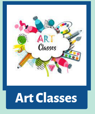
• Classes meet daily for 40 minutes!