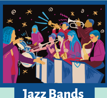
Ensembles & Improv