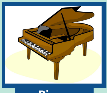
Piano Group & Private Lessons