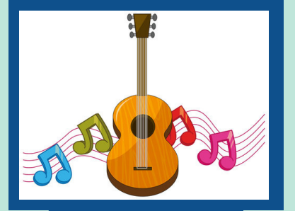
Guitar / Ukulele Lessons & Ensembles